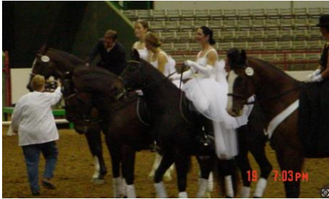
Another group doing something!! (found picture but no info... 22 yrs ago!)

Whatever your imagination and creativity, we hope that the Anything Goes Freestyle Exhibition can once again grow!! Standby or details on the perspective date. Despite the many rules that USEF puts in place to ensure a strict amount of fun without breaking rules, many other competitions host similar events with success. Details will continue being posted in Collective Remarks