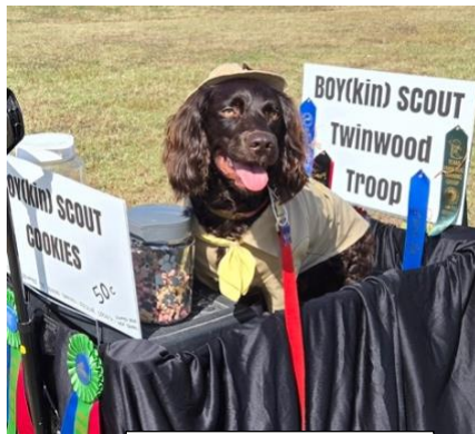
Brodie (a Boykin Spaniel) Is a "BOYkin Scout"