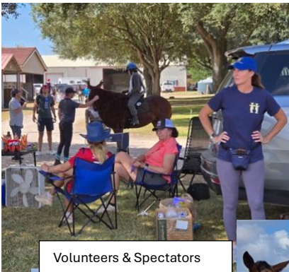
Volunteers & Spectators