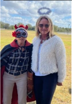
Devil Judge, Fran Angel Scribe, Patty