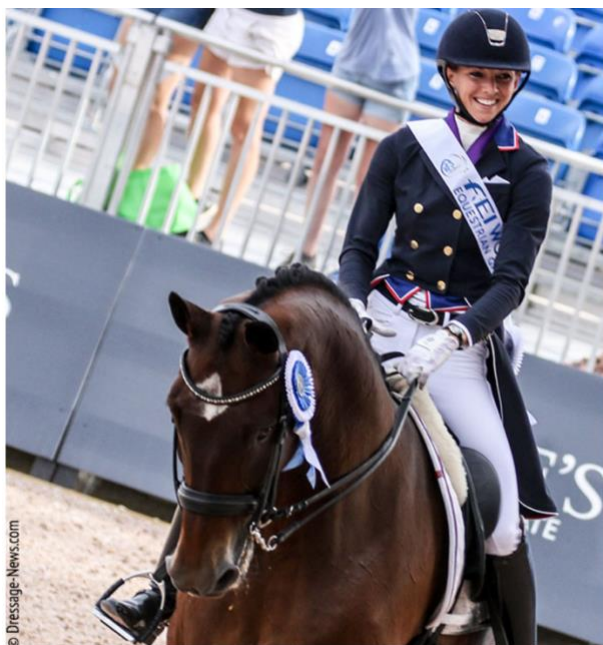
Verdades ridden by Laura Graves to celebrate Tryon World Equestrian Games silver medal.

Both partnerships began with the horses as youngsters and developed by the riders over years to the pinnacle of the sport.